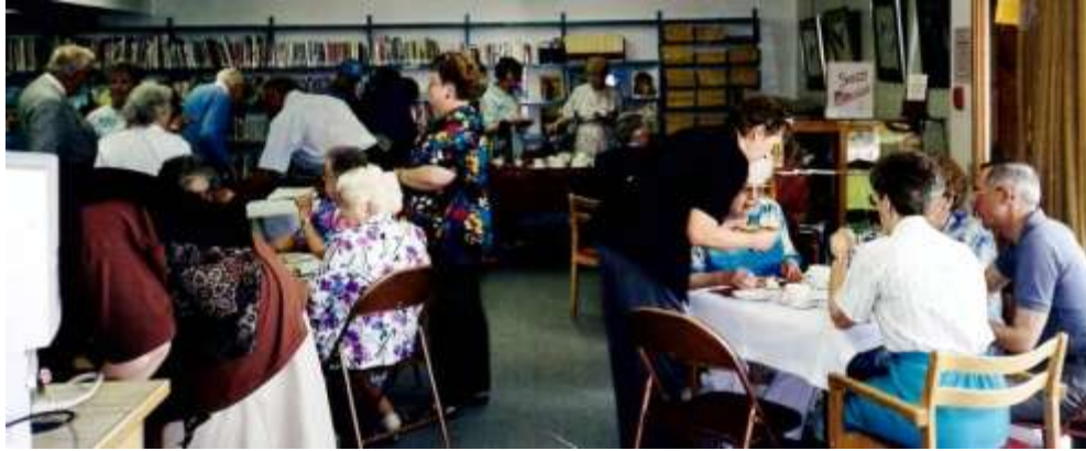
40 th Anniversary Tea