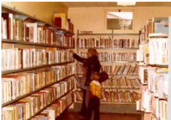
Averill, Daphne, and Rod Whitfield visiting the library at the Civic Centre location

Although the Library Board continued to search for another building, the library remained in this location for another 11 years. Other locations such as the old Post office and the old Royal Bank building were considered.