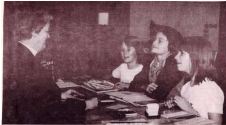
Published in the Souris Plaindealer November, 1979